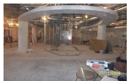
Renovate Inpatient Psychiatry & Substance Abuse Unit Columbia VAMC