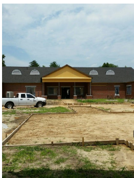
Brick Installed on new CLC Building