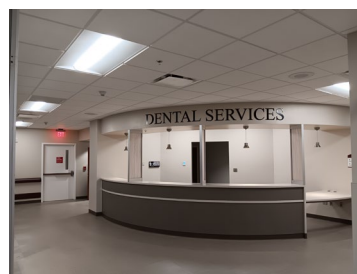
Renovate D-Wing Basement for Dental Fayetteville VAMC