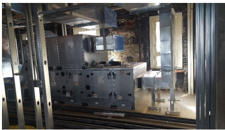
Mechanical Room Air Handler Unit