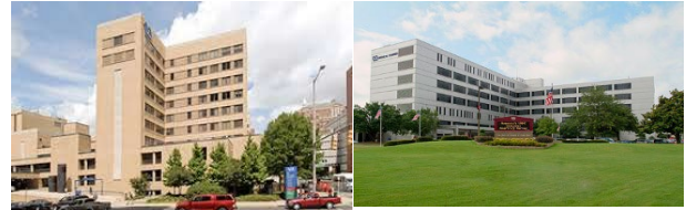
Various Veteran Affairs Locations