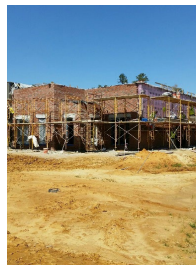
Roofing & Brick Complete on 13 Bed Unit