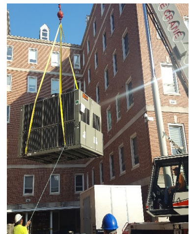
Crane Setting Chiller on new pad