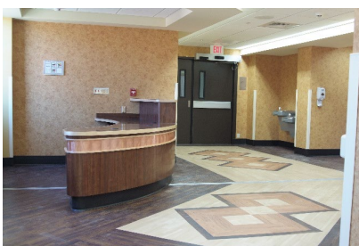
New Mental Health Unit, Fayetteville VAMC